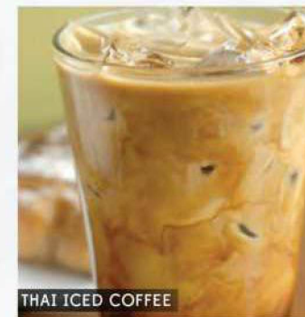
THAI ICED COFFEE