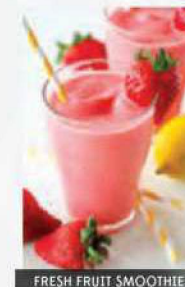
FRESH FRUIT SMOOTHIE