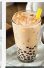
ICED MILK MOCHA