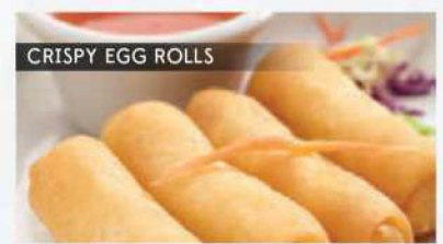
CRISPY EGG ROLLS

POT STICKERS Delicious pastries filled with chicken and vegetables crisped to a golden brown, served with our delicious sweet and tangy soy sauce. 6.99