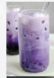
ICED MILK TARO