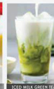
ICED MILK GREEN TEA