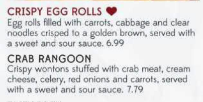
CRISPY EGG ROLLS

SRIRACHA FRIES Crispy french fries drizzled with our homemade creamy and spicy sriracha Sauce. 4.99